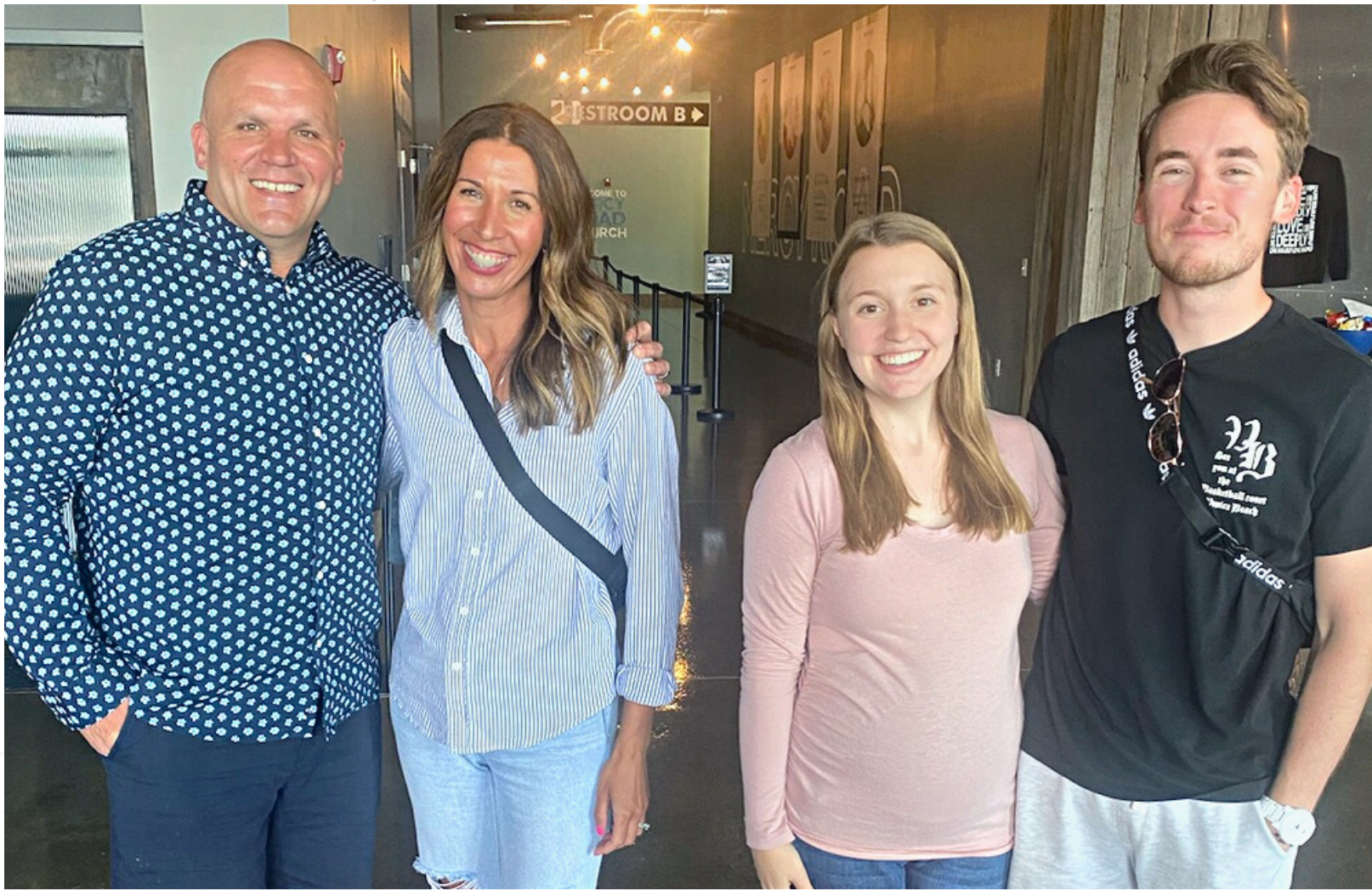
Completed 7 live Volunteer Trainings!