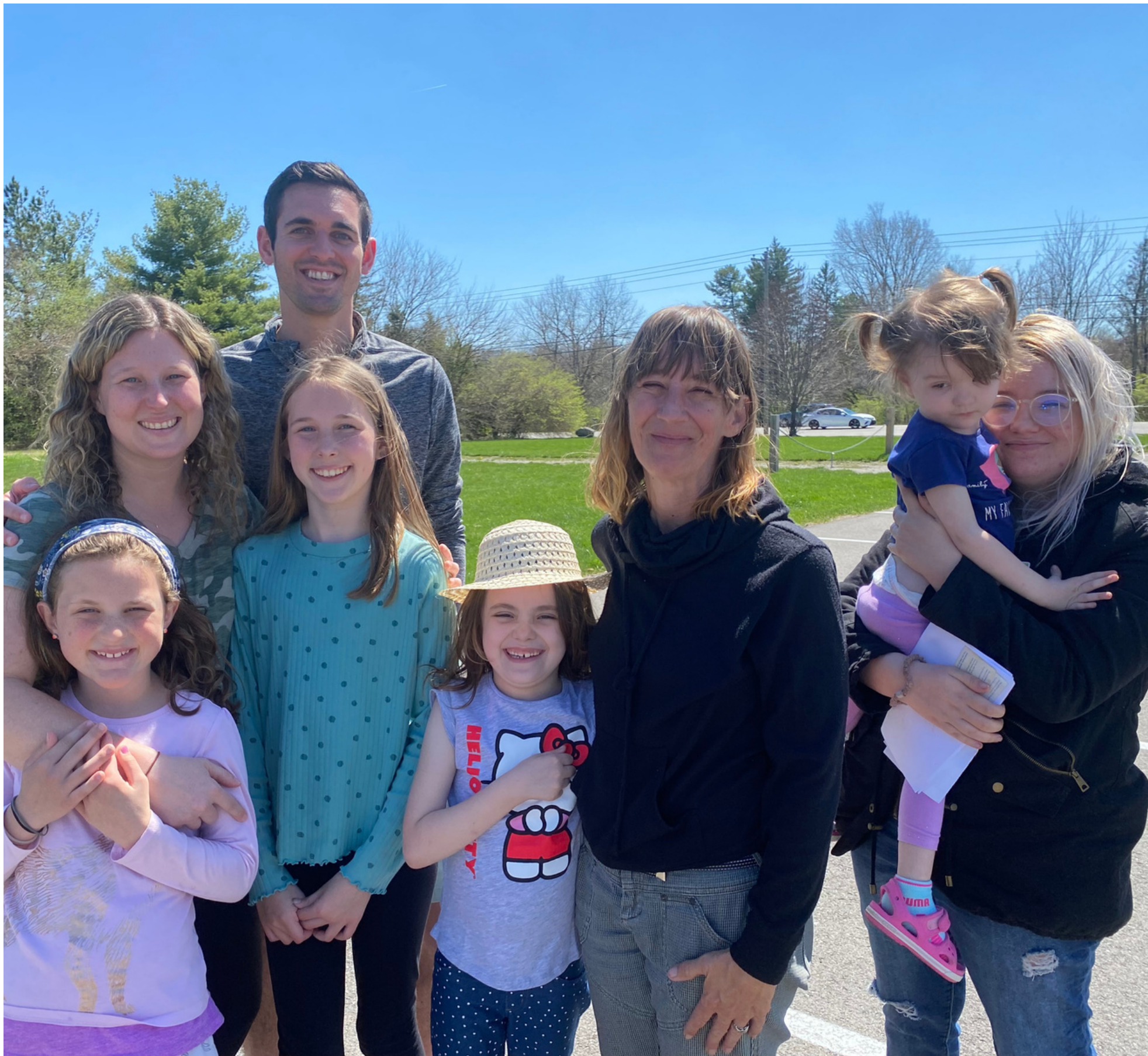
All smiles to be reunited with Mama!