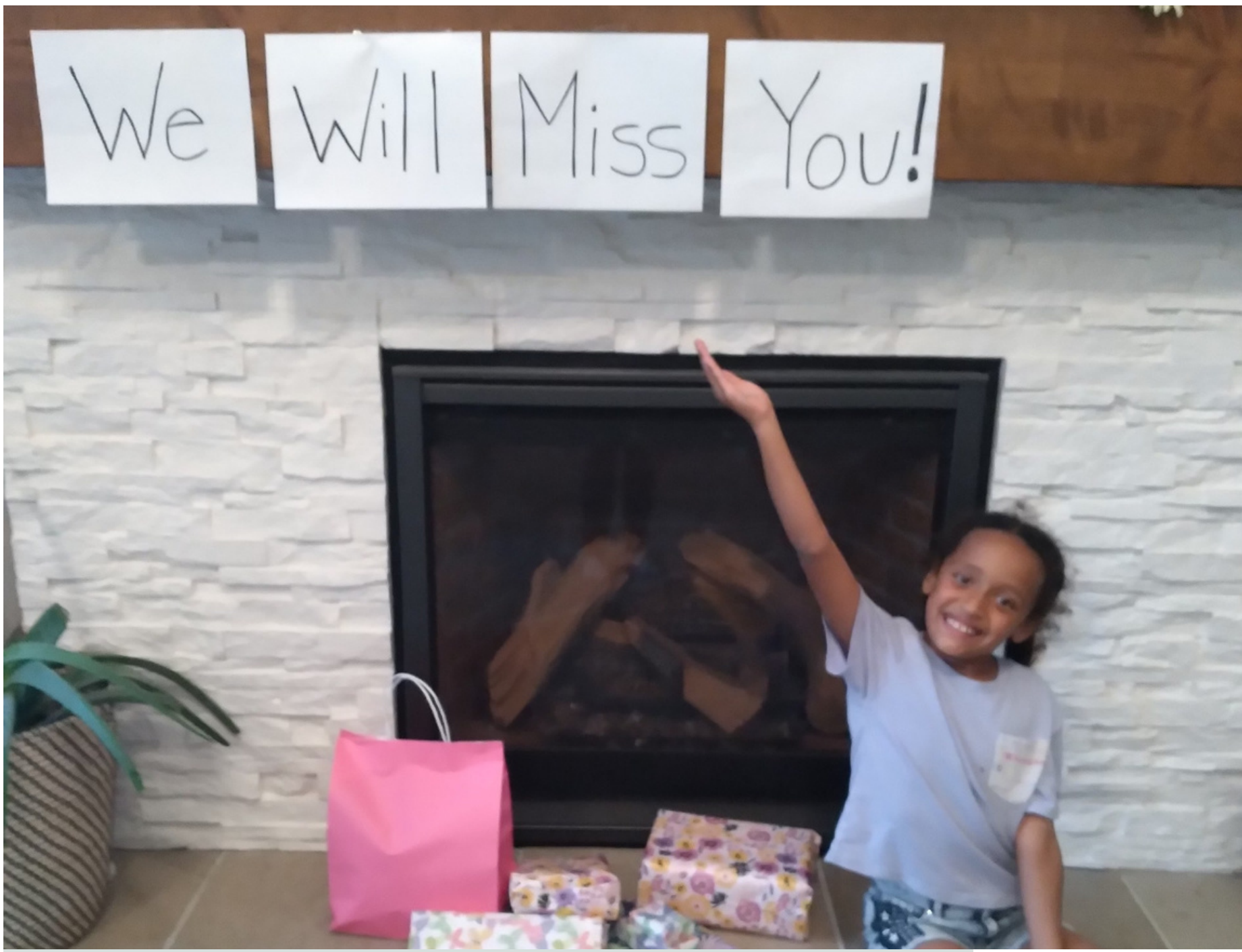
Sweet "Goodbyes" captured by a Host Family!

of God's GOODNESS shared by those served and those who get to serve!