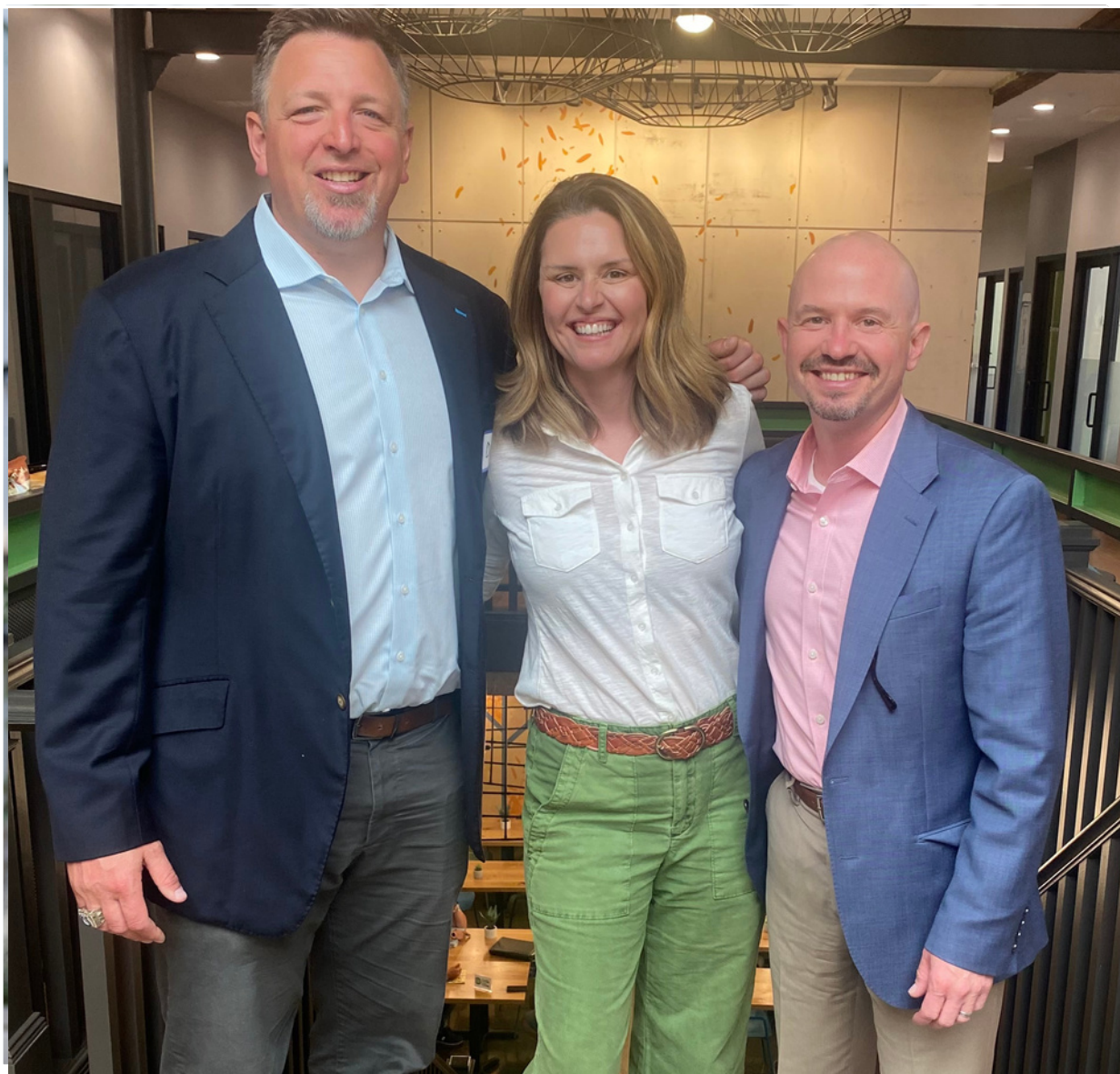
Organized our first Family Hope "Lunch on Us!"