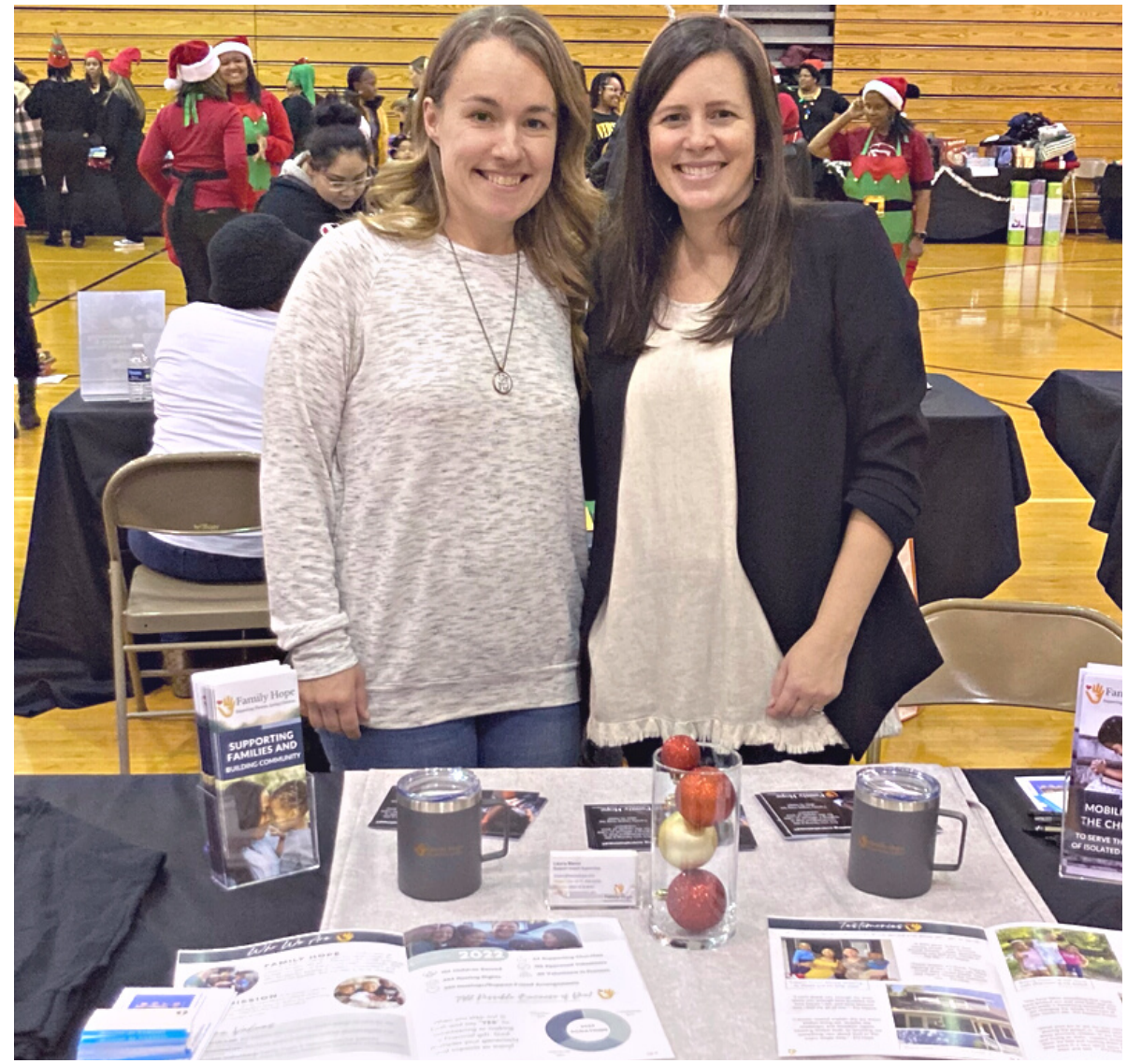
Attended 19 Info Sessions & Event Tables!