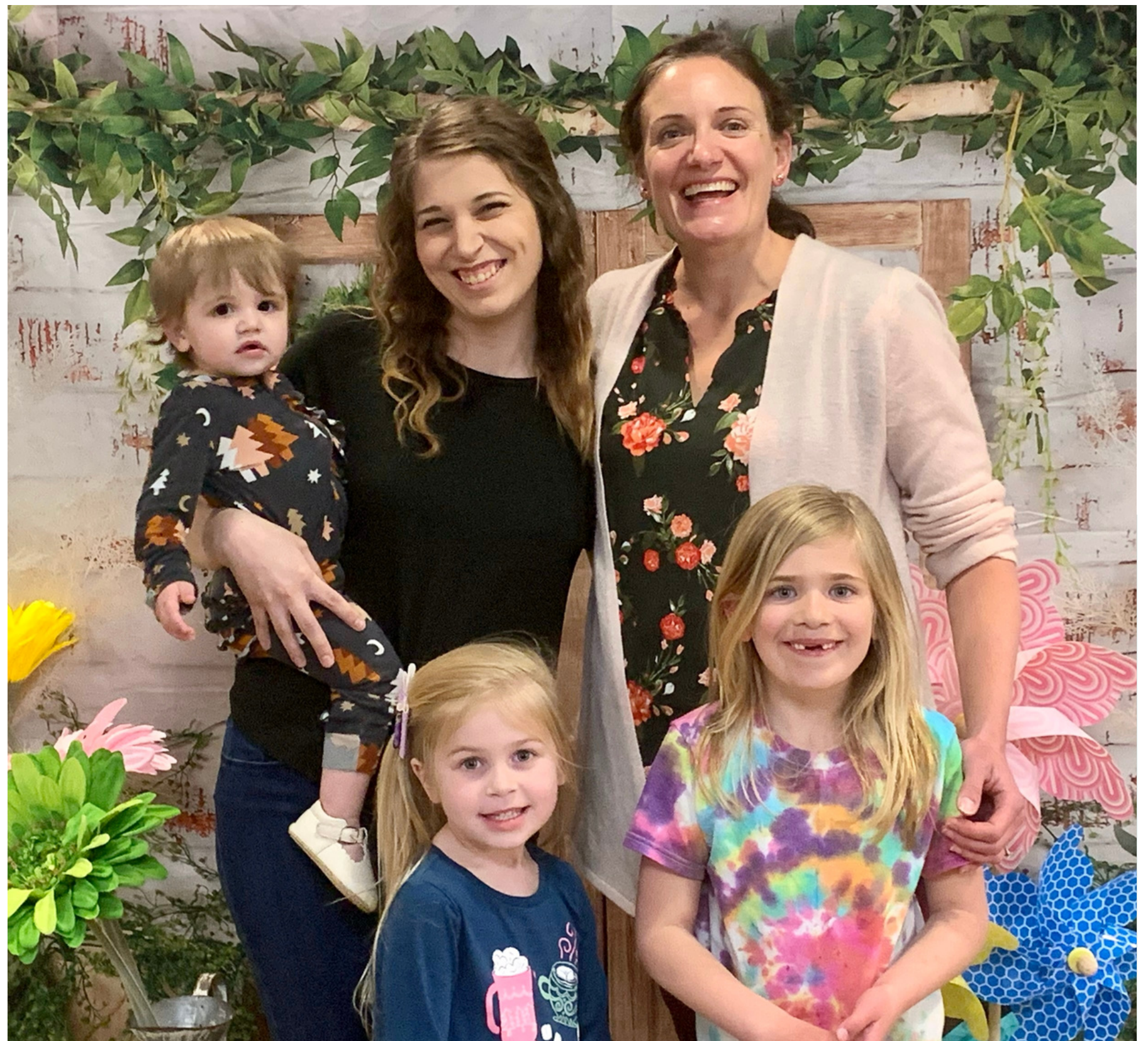
Mama attending Easter church service with her Host Family!