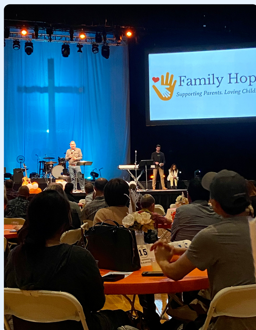
Eagle Church hosting our 2023 Celebration of Hope!